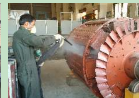
2 -CRYOGENIC CLEANING MACHINES (DRY ICE/CO2)