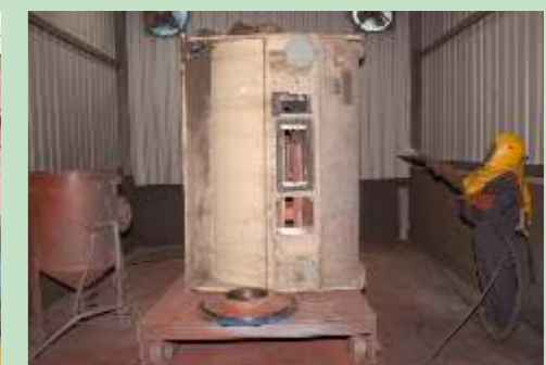
GRIT BLASTING UNIT