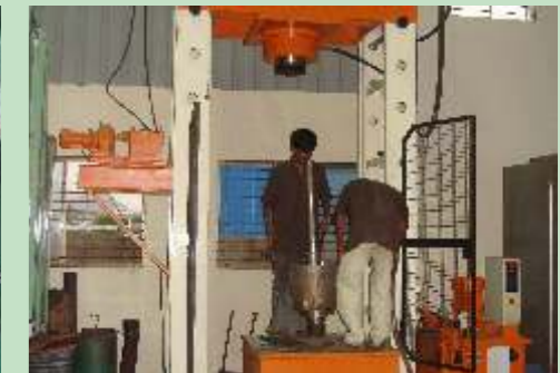
HYDRAULIC PRESS 400Ton x 4 Mtr. Height