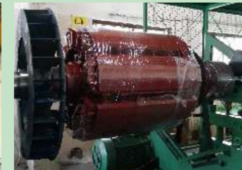
18 TON DYNAMIC BALANCING MACHINE 9 Mtr LENGTH