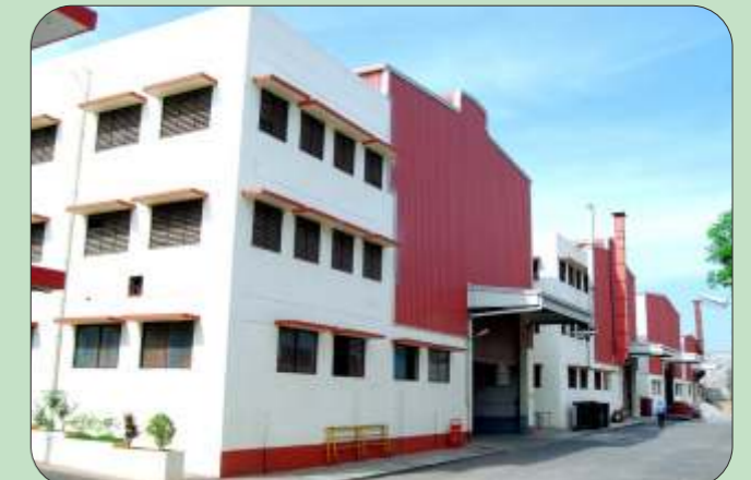
Major Repair Works at Tumakuru (Bengaluru)