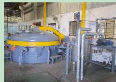
2-VPI PLANTS 1.5 Mtr Dia x 2.0 Mtr . Height 2.5 Mtr Dia x 3.0 Mtr. Height