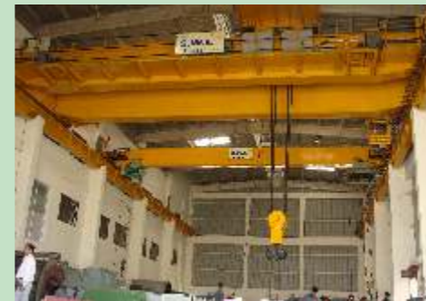
65 TON OVERHEAD CRANE