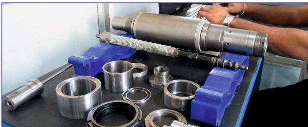
Mechanical Parts Inspection